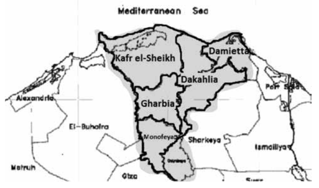
Figure 1. Geographic map for the Nile Delta region Area of the study (Dakahlia, Damietta, Kafr El-Sheikh, Gharbia and other governorates)

The frequency of T1DM diagnosis significantly increased with age, reaching a peak at age group 6-10 years (p=0.000),