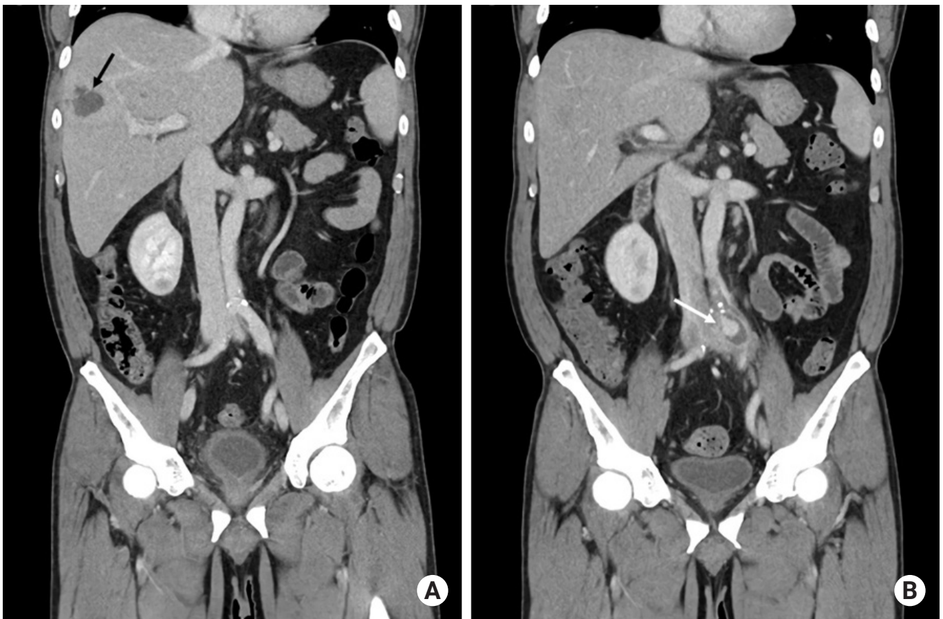
Figure 1. (A) Low-density lesion in the liver (black arrow) and (B) new aneurysmal dilatation with thrombosis, wall enhancement, and periarterial fatty infiltration in left common iliac artery (white arrow) are observed using enhanced abdominal computed tomography.

drainage of the liver was performed, and a yellowish fluid was drained. The patient was diagnosed with DM (glycated hemoglobin, 9.8%) on admission. K. pneumoniae with susceptibility to all antibiotics except ampicillin was isolated from blood and liver abscess culture (BACT/ALERT 3D system; bioMérieux, Marcy-l'Étoile, France) on August 2, 2020 (Table 1). The cultures were incubated for 24–48 hours, inoculated onto blood agar, and colonies were collected from the plates for identification using an automated system (VITEK II, bioMérieux). The antibiotic agent was changed to ciprofloxacin, which has a definite narrow spectrum on August 2, 2020. There were no abnormal findings on ophthalmological examination, brain magnetic resonance imaging, and transthoracic echocardiography. After antibiotic administration and liver abscess aspiration, bacteremia and inflammation marker were improved. However intermittent up to 38°C of fever has been continued. Although liver abscess and metastatic infections improved on follow-up CT on the 11th day of hospitaliza-