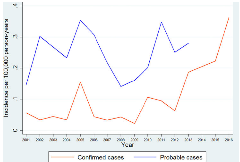
Fig. 1. Annual incidence rates for probable and confirmed cases of imported leishmaniasis in Sweden 1993–2016.

and assessed clinical presentation, patient characteristics, probable country of infection and species distribution.