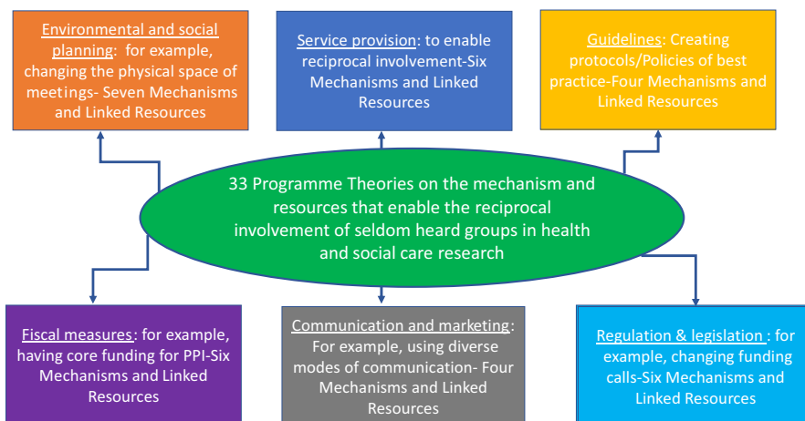
FIGURE 2 Programme theories linked to behaviour change wheel policy categories