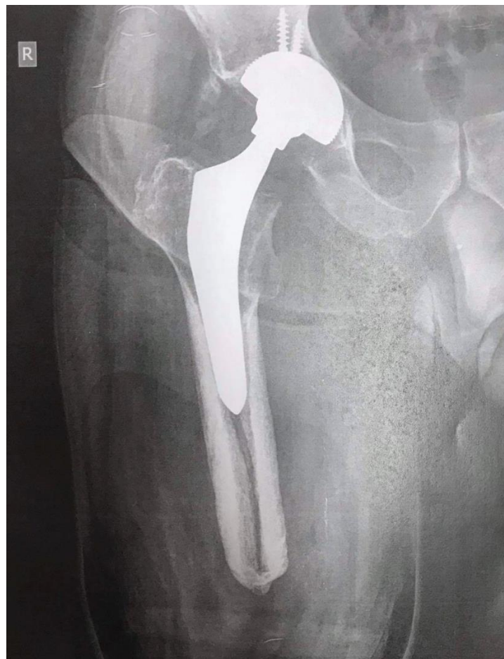
Fig. 4. Postoperative radiograph at 6 months. No osteolysis and a well incorporated prosthesis was noted