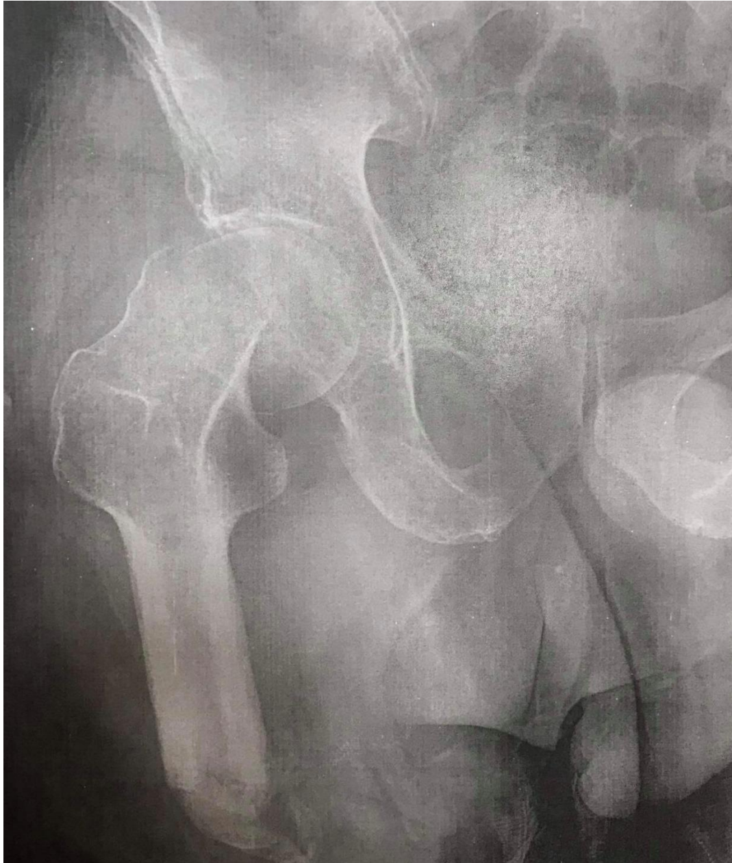
Fig. 1. A Garden III femoral neck fracture

the log roll test, and there was axial percussion pain. The overlying skin was intact, with a well healed surgical scar over the stump and normal sensation and circulation. No other injuries were identified. Radiographs demonstrated a Garden III femoral neck fracture (Figure 1).