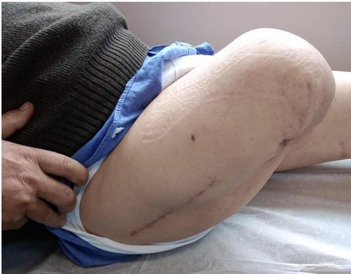
Fig. 2. At the most recent follow up at six months, there was no evidence of surgical site infection or wound dehiscence

At the most recent follow up, six months following THA, the amputated limb was in good condition (Figure 2). On examination he had good range of motion in his hip, without any pain. Wearing the prosthesis, no leg length discrepancy was noted. Radiograph showed well-incorporated femoral and acetabular components without any sign of osteolysis (Figures 3 and 4).