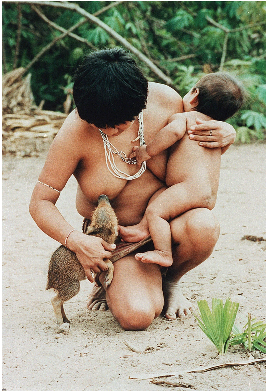
Figure 1 Native Guajá from northeastern Brazil breastfeeding a wild pig. Source: Pisco Del Gaiso, Folha de São Paulo - Brazil, 1992. The authors have received permission from the copyright holders Pisco Del Gaiso, Folha de São Paulo - Brazil to reproduce the image in this publication.

tapeworm larva. The adults usually occurred in other sympatrically occurring scavenging carnivores such as hyenas. After switching hosts, a speciation event occurred and humans maintained their own two species of Taenia . Therefore, these cestodes of humans adapted to pigs and cattle as intermediate hosts sometime after domestication of these animals. Molecular biology