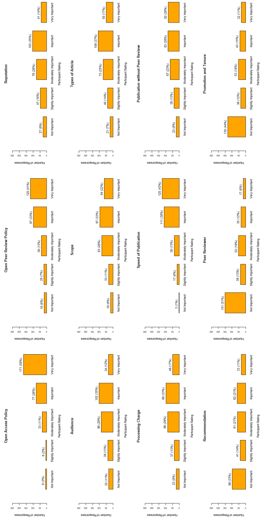
Figure 2. The level of importance of factors that were influential to authors when deciding to publish with F1000 Research.