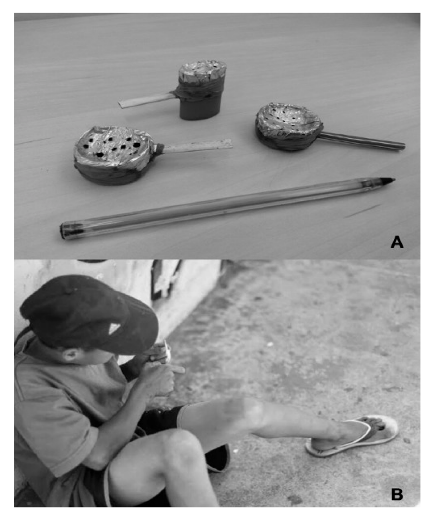
Figure 2. Characteristics presented by the participants in this study. (A) Pipes prepared manually and used to smoke crack-cocaine. (B) PWUCC living on the street.

supervision for HEV and other viruses. Only two blood plasma samples belonging to PWUCC with positive anti-HEV IgG + IgM tests results had HEV-RNA. On the other hand, HEV-RNA was detected in all of the fecal samples belonging to PWUCC with positive anti-HEV IgG + IgM test results (n = 6) (Table 2). HEV-RNA was not detected in the feces and blood plasma samples from PWUCC with positive results only for Anti-HEV IgG. The viral load varied from 25.2 to 34.5 IU/mL, with the lowest values detected in the blood plasma samples (25.3 IU/mL and 25.4 IU/mL). Subtype 3c was detected in all of the fecal samples of the PWUCC (Figure 3). There was no success in HEV genotyping using the two blood plasma samples with HEV-RNA. HEV-RNA was detected among PWUCC in the municipalities of Bragança (n = 3), Breves (n = 1), Capanema (n = 1), and Castanhal (n = 1).