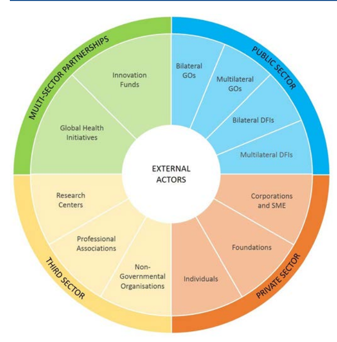
Figure 1 Typology of external actors in global health: four overarching groups and their types of actors. DFIs, development financial institutions; GOs, governmental organisations; SME, small and medium enterprises.

With most LMIC governments already under considerable economic pressure, external funding is urgently needed. In line with the Addis Ababa Action Agenda, the United Nations sustainable development goals (SDGs) recommend the mobilisation of additional external funding from a wide range of sources (eg, development assistance, foreign direct investments (FDIs), remittances) while assuring sustainability through local ownership and a gradual increase in domestic resources. It is therefore important to identify who those key external actors are in global mental health.