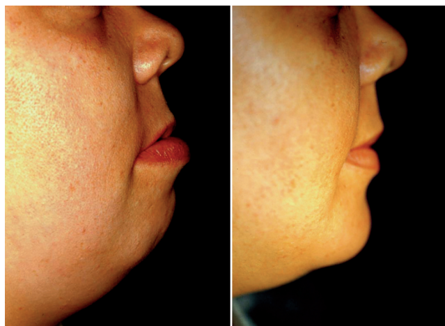
Figure 3. Angle of the neck in pre-and postoperatively.