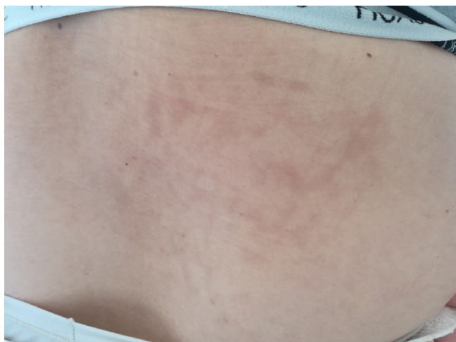
Figure 3. A non-pruritic macular rash emerged on the patient's back on the second day of hospitalization, without further evolution.

cases have been described in hematological patients, mainly among individuals with a history of hematopoietic stem-cell transplantation. 5,6 There have also been rare cases of visceral involvement in patients with autoimmune or inflammatory bowel diseases attributed to the use of immunosuppressive therapy, such as steroids, disease-modifying antirheumatic drugs, biological agents, and small-molecule drugs. 6,7 Among these drug classes, steroids, either as monotherapy or as part of combined immunosuppressive therapy, display the strongest correlation with VZV reactivation overall. 7,8 Similarly, in our patient with psoriatic arthritis, the temporal association between the addition of high-dose of steroids on top of infliximab biosimilar (Inflectra®) and the occurrence of visceral HZ implies a causal relation.