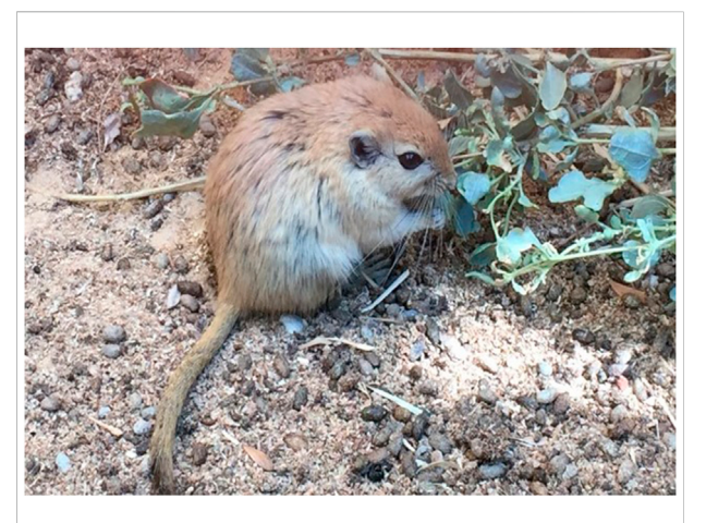
FIGURE 1 The fat sand rat ( Psammomys obesus ) feeding on its favorite diet, saltbush ( Atriplex halimus ).

Considering that the circadian systems of nocturnal and diurnal mammals differ significantly via an as yet unknown mechanism, it is surprising that most biomedical research regarding disorders in diurnal humans, including those related to the circadian system, has been performed using nocturnal animals such as laboratory mice and rats. In the literature about the development of animal models it was repeatedly noted that the selection of model organisms for most studies puts significant constrains on research and must be acknowledged and addressed (Bolker, 2012). Moreover, significant work in the field of animal