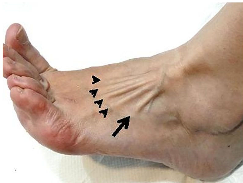
Fig 1. Dorsolateral view of left foot and ankle showing the tendons of the fibularis tertius (arrow) and the extensor digitorum longus tendons (arrowheads).

https://doi.org/10.1371/journal.pone.0215118.g001