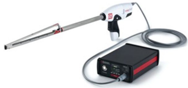
Fig. 1 Titan SGS stapling device and power cord

Participants were selected from the trial physicians’ existing patient populations and screened for eligibility. Inclusion criteria were defined as patients age 18 to 65 undergoing a