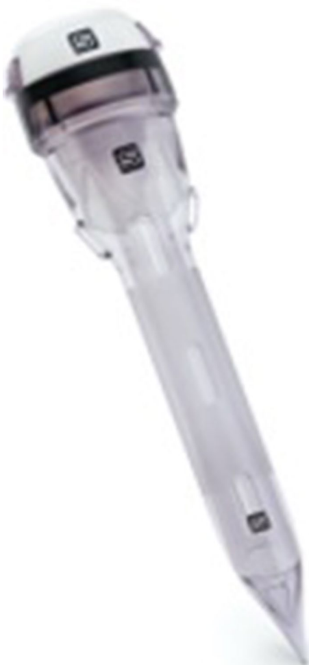
Fig. 3 19 mm Standard Trocar for use with Titan SGS stapler

of the liver, repair or removal of the spleen) need for re-operation for missed injury directly due to the stapler