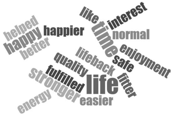
Fig. 3. Key positive themes extracted from informal patient feedback.