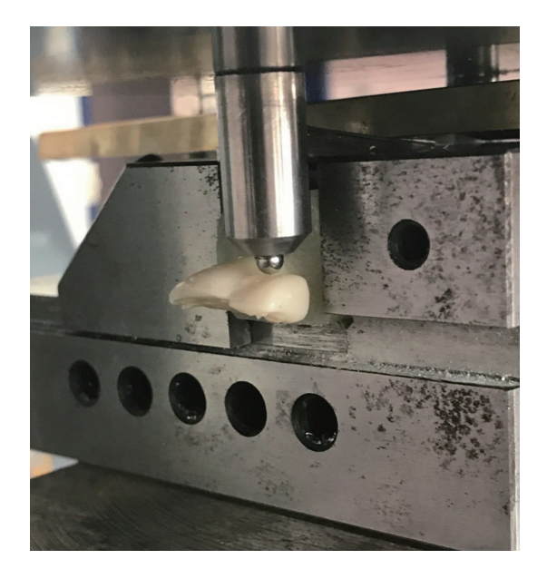
Fig. 2. Point of application of the shear forces and illustration of the device.