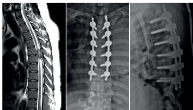
Figure 1. Sagittal cut of T2-weighted preoperative magnetic resonance evidencing image compatible with extradural metastasis by compressing the spinal cord canal at T5-T6 level. Postoperative radiographies of decompression and posterior fixation with pedicular screws.

Regarding the surgical procedures used, all 44 patients underwent treatment by the posterior approach. In 19 (43.1%) patients, decompression and posterior fixation with pedicular screws were performed (Figure 1), whereas 16 (36.3%) patients underwent decompression and posterior fixation with pedicular screws associated with corpectomy and replacement with an intersomatic device filled with bone cement (Figure 2). In addition, kyphoplasty was the chosen surgical procedure in nine (20.4%) patients.