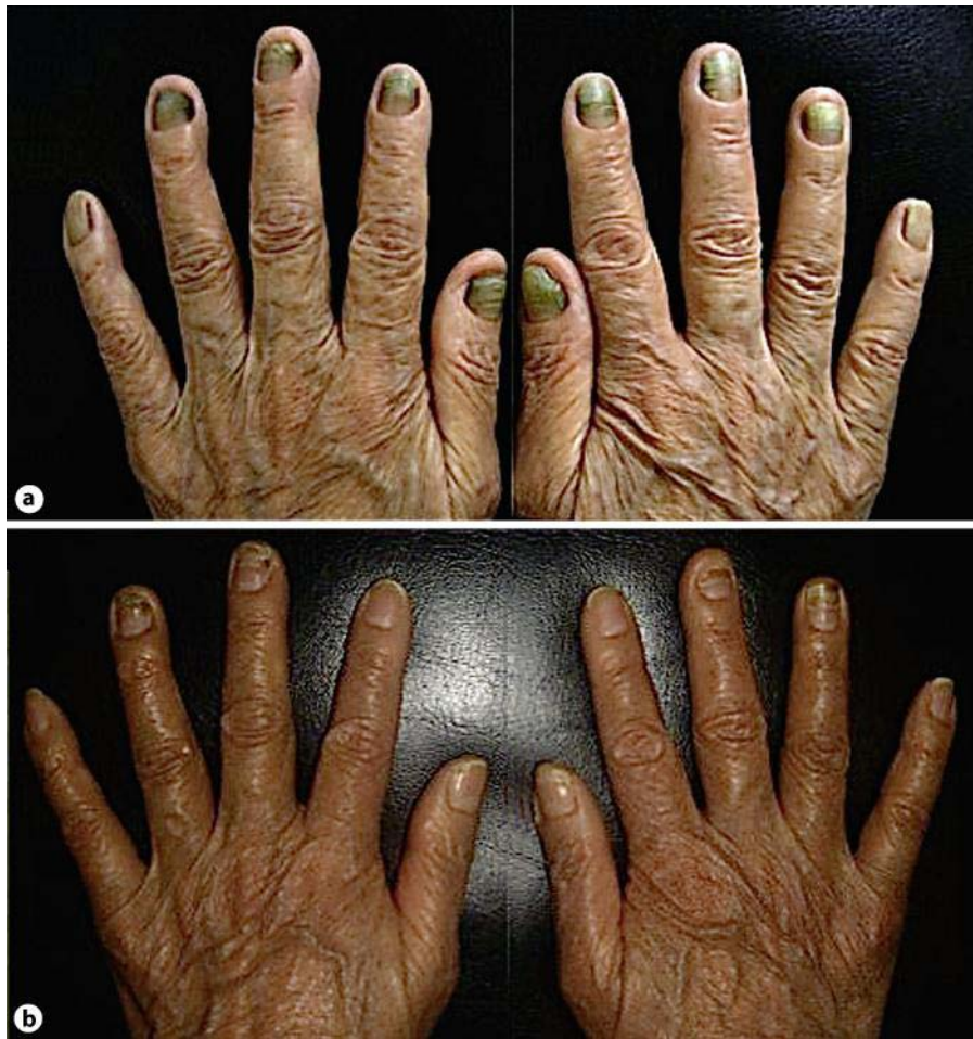
Fig. 3. The yellow nails improved dramatically after 9 months of CAM treatment. a Pretreatment. b Posttreatment.