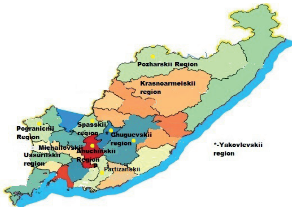
Fig. 1. Map of research area (Primorye region).

suriiskii, Spasskii, Partizanskii, Pogranichnii, Yakovlevskii, Krasnoarmeiskii, Pozharskii and Chuguevskii districts. Each sample was placed in plastic jar that labeled with records of the animal's age and sex. The age of each boar has been determined through examination of the teeth, as described by Sáez-Royuela et al. (1989) (Table 1, Fig. 1).