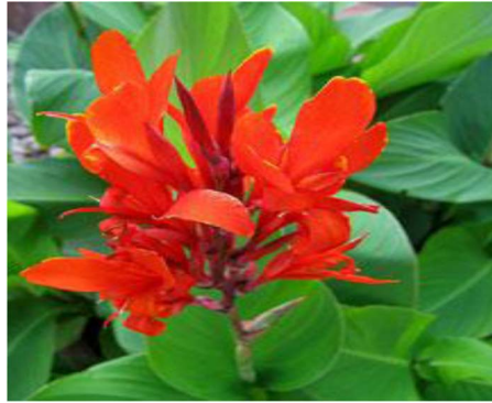
Fig. 1. Image of the utilized Canna indica (FHI No. 109928).