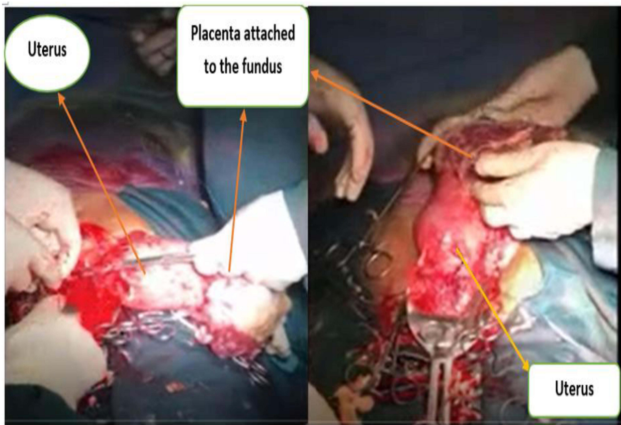
Figure 4 Picture showing placental attachment to fundus of the uterus.

A. An absence of myometrial tissue between the maternal bladder and the pregnancy, abdominal wall and pregnancy. B. An empty uterus. C. Poor definition of the placenta. D. Oligohydramnios. E. Unusual fetal lie. 1,14 In our case the ultrasound findings are similar to the ones indicated above. Rarely magnetic resonance imaging (MRI) can be used for the diagnosis of abdominal pregnancy. 10,15