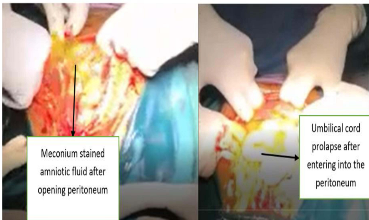
Figure 2 Amniotic fluid leaking and cord prolapsing upon abdominal entry.

Abdominal pregnancy is an extremely rare but life threatening type of pregnancy which is implanted in the peritoneal cavity outside of the uterine cavity and fallopian