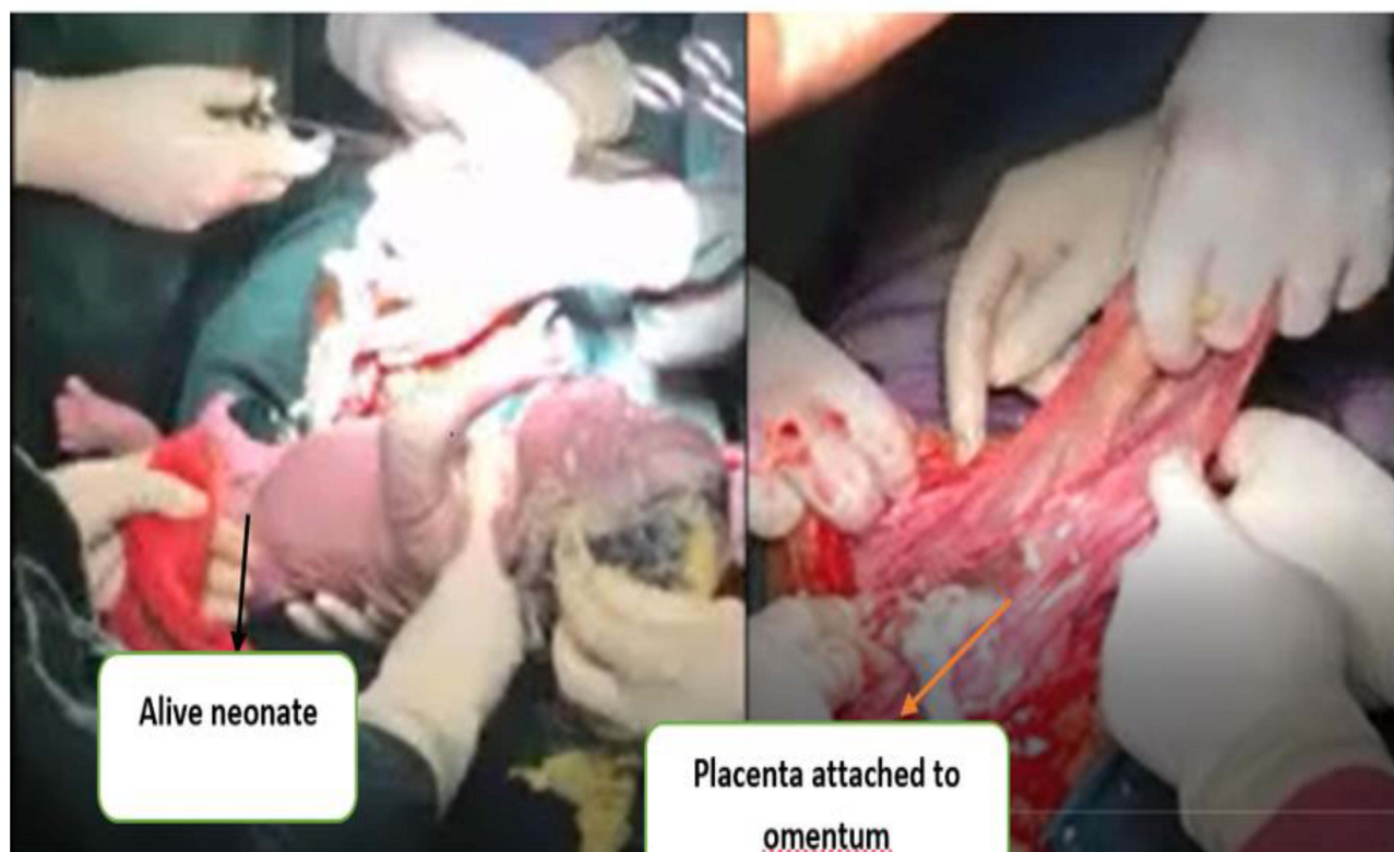
Figure 3 Live baby and placenta attachment to the omentum.

tube. 1,2 It accounts for 1 per 10,000 births and accounts for 1.4% of ectopic pregnancies. Abdominal pregnancy is usually misdiagnosed as an intrauterine pregnancy during antenatal care. 2 In the first trimester, it is missed as tubal pregnancy and in late trimester it is missed as intrauterine pregnancy. 1,9–11 Abdominal pregnancies can be classified into primary and secondary type based on the primary site of the gestational implantation. The primary type of abdominal pregnancy is a type of ectopic pregnancy in which the blastocyst primary implanted inside the peritoneal cavity while the secondary type of abdominal pregnancy is initially implanted either in the tube, uterus or ovary but later migrates out due to tubal or uterine rupture or tubal abortion, then it will be implanted into the peritoneal cavity. 1,10 In 1942, Studdiford introduced the following three diagnostic criteria for primary abdominal pregnancies. These are; 1. both tubes and ovaries must be in a normal condition with no evidence of recent or remote injury, 2. no evidence of utero-peritoneal fistula should be found; and 3. the pregnancy must be related exclusively to the peritoneal surface and be early enough. 12 In this case though the bilateral tube and ovary looked normal, the placenta is attached and getting blood