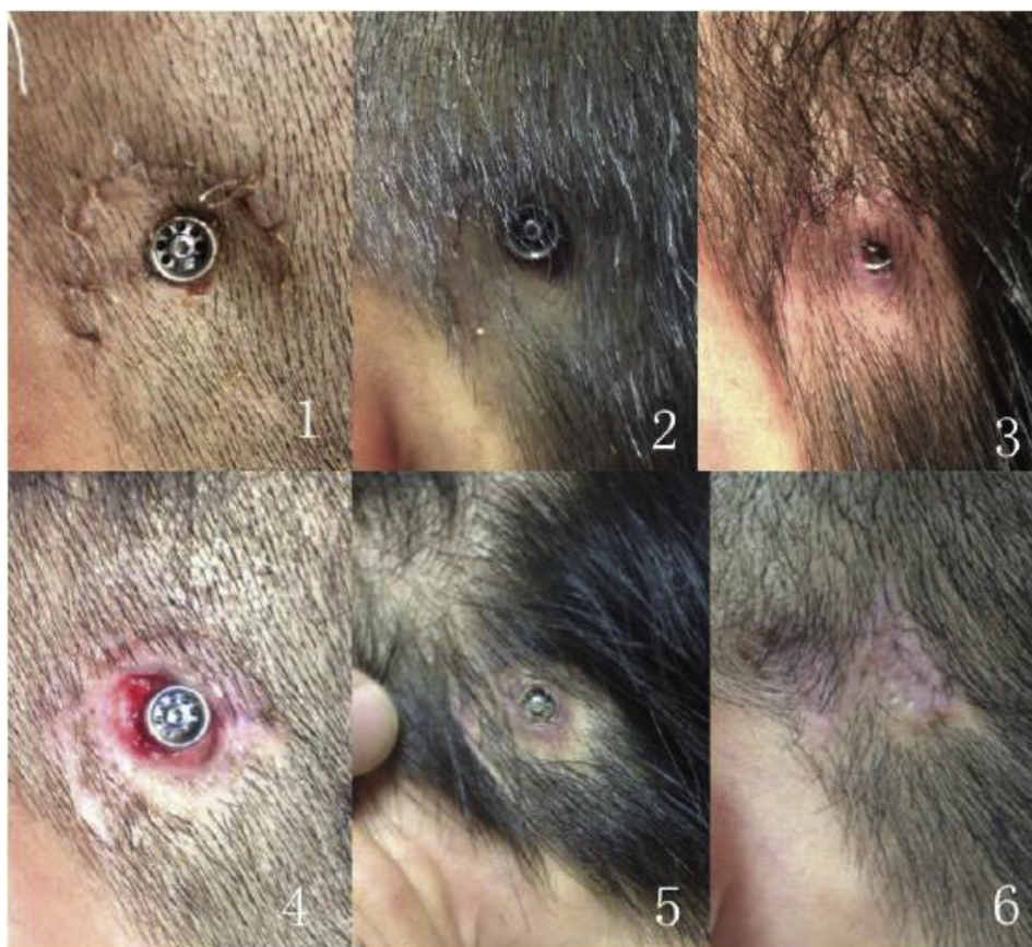
Fig. 2. Skin reactions after BAHA implantation. (1). Five days after BAHA implantation surgery. (2). Two weeks after BAHA implantation surgery. (3). Hyperplasia at three months after BAHA implantation surgery. (4). After first skin removal surgery. (5). After third skin removal surgery. (6). After BAHA removal.

multinucleated cells and plasma cells (Holgers, 2000). Skin reactions caused by BAHA implantation are typically evaluated using the scoring system described by Holgers et al. (1988), with no skin irritation being grade 0, mild redness being grade I, redness and moisture being grade II, granuloma formation representing grade III, and clear local skin infections defined as grade IV.