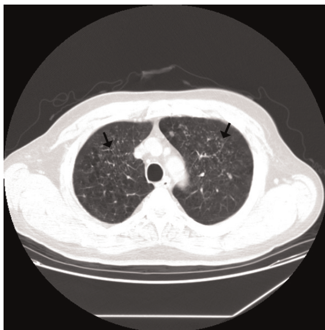
Figure 2. Computed Tomographic (CT) Scan of the Chest: Arrows show multiple small reticulonodular opacities.

The patient retired from his job after his initial evaluation. His respiratory symptoms, which first appeared after about fifteen years of the initial exposure to iron dust, resolved