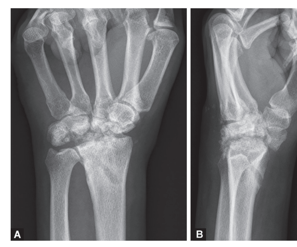
Figs 5A and B: Postoperative radiographs 24 months after wrist arthrodesis show a successful radiocarpal arthrodesis. The patient remains asymptomatic with excellent function

the patient does not report any further pain or tenderness. He has resumed his work fully as a construction worker. He does not refer to disability. Functional assessment using the QuickDASH questionnaire was excellent, with a score of 11 points. Radiographic evaluation shows a successful radiocarpal arthrodesis (Fig. 5).