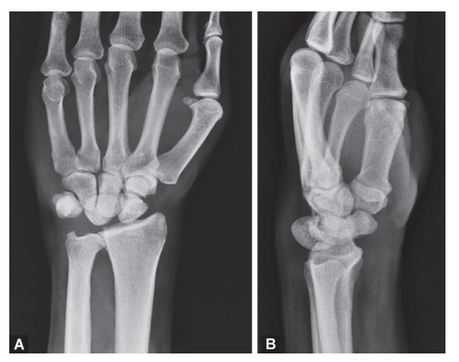
Figs 1A and B: Initial plain radiographs of the wrist (anteroposterior and lateral views) show a dorsal dislocation of the lunate with corresponding distortion of the Gilula's lines. There is no evidence of any carpal bone fracture