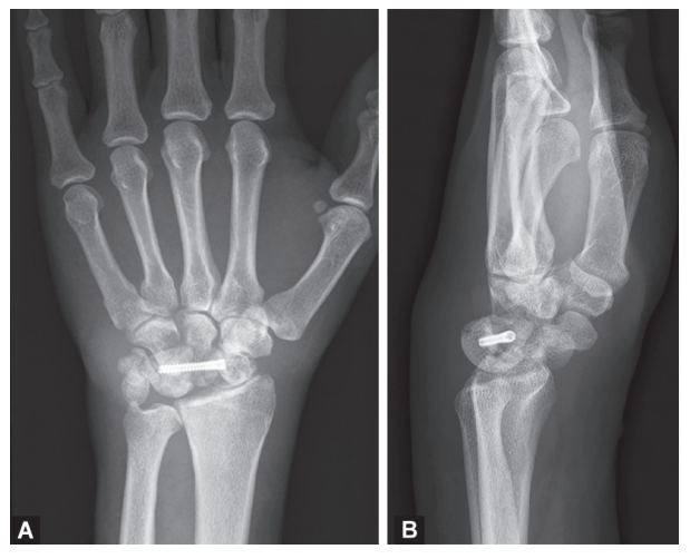
Figs 4A and B: Postoperative radiographs at 2 months show a relapse of the instability. The lunate is dorsally dislocated and a decrease in carpal height can be observed

tissue with minor residual ligament attachments. A complete rupture of scapholunate and lunotriquetral ligaments was noted with no remnants to facilitate a primary repair (Fig. 2). There was no evidence of articular cartilage disruption of the lunate or the proximal pole of the capitate. Although the lunate could be reduced into its place gently, this was very unstable and dislocated again with the wrist in the neutral position. A K-wire was used as a joystick and worked to hold the lunate in its place temporarily. We placed a 24-mm headless cannulated screw between the scaphoid and lunate. Additionally, we used K-wires connecting triquetrum to lunate and scaphoid to capitate (Fig. 3). An implant-related fracture occurred in the scaphoid intraoperatively.