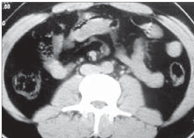
Figure 1: Non-contrast computed tomography showing left ureteric calculus