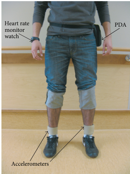
FIGURE 1: Placement of the ABLE system on a patient. Highlighted in the figure is the personal digital assistant (PDA) data logger worn around the waist of the patient, bilateral placement of accelerometer straps worn superior to the lateral malleolus, and heart rate wrist watch data logger.

approximately eight hours, between approximately 9 am and 5 pm.