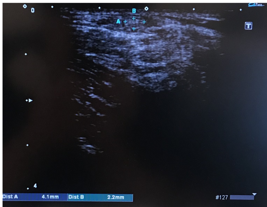
Fig. 1 Ultrasonography images of the short-axis view. The diameter (a) and breadth (b) of the semitendinosus tendon

Patients were categorized into two groups as follows: the ST group, in whom only the ST tendon was harvested; and the semitendinosus gracilis tendon (STG) group, in whom the G tendon was also harvested. To evaluate between-group differences, Fisher's exact test was used