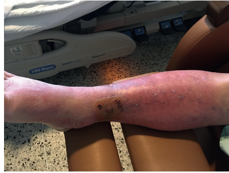
FIGURE 1: Image of the patient's leg.