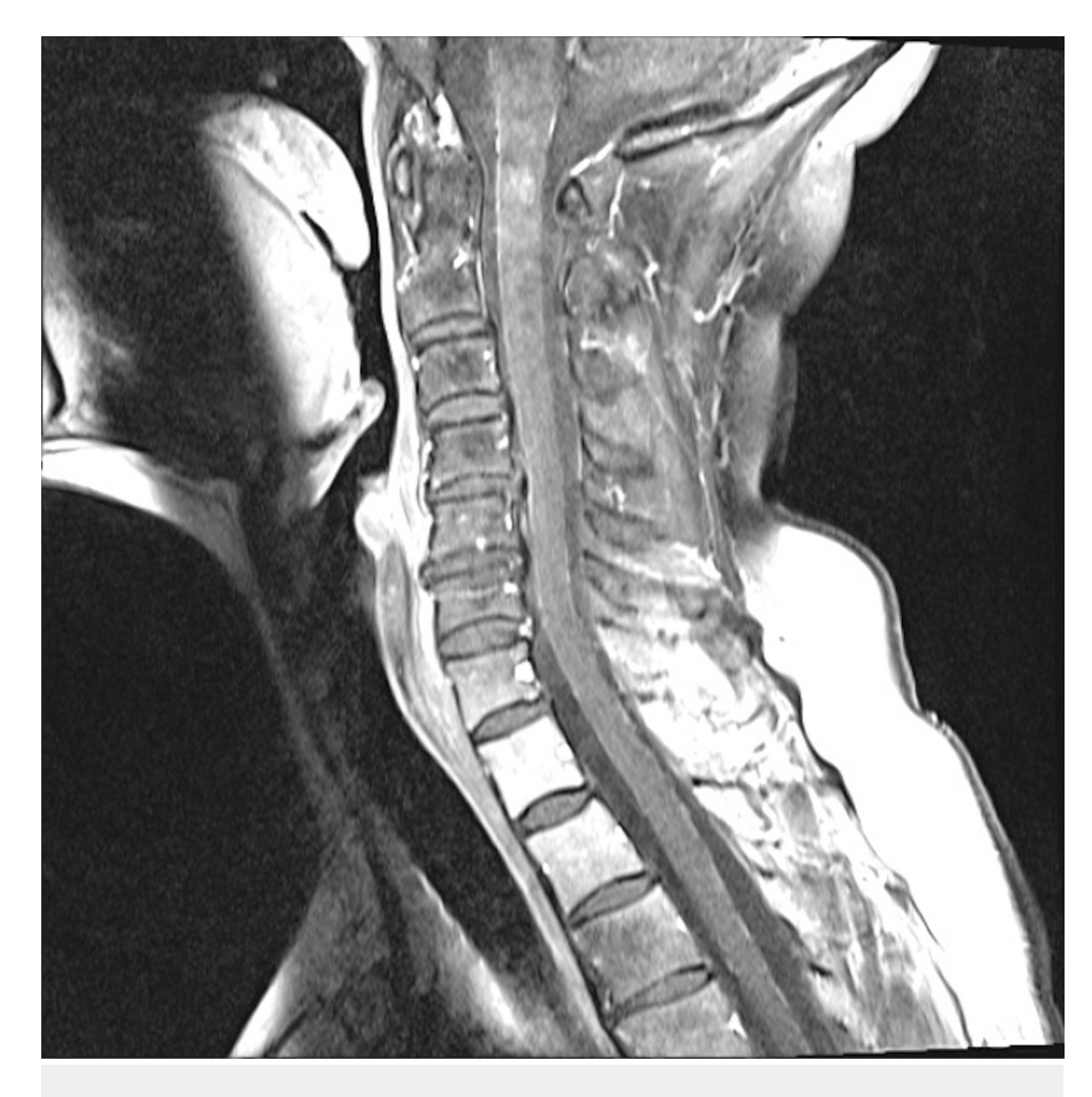
FIGURE 1: Cervical Spine MRI

Sagittal MRI of the cervical spine demonstrated nodular contrast enhancement of the lesion at the cervicomedullary junction.