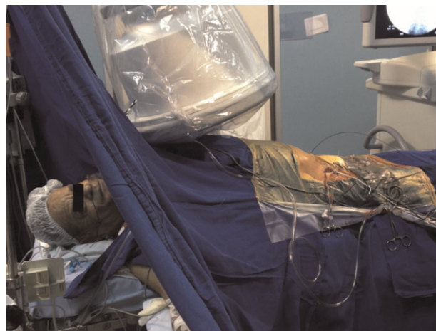
Figure 1 - Image shows an awake patient being treated for a ruptured aneurysm under local anesthesia.

The other 16 EVAR cases were treated with bifurcated endografts. Contralateral gate cannulation and a complete endovascular procedure were possible in all patients. Furthermore, aneurysm exclusion, which was evaluated on the angiogram and performed at the end of the procedure, was achieved in 100% of cases in the endovascular group. No patient required emergent conversion of bifurcated stent grafts to AUI devices or open surgery.