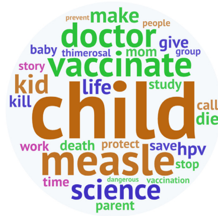
Doctors Vaccinating Children