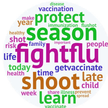
Fighting the Flu during the Flu Season