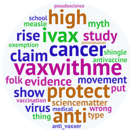
Vaccine Science Matters