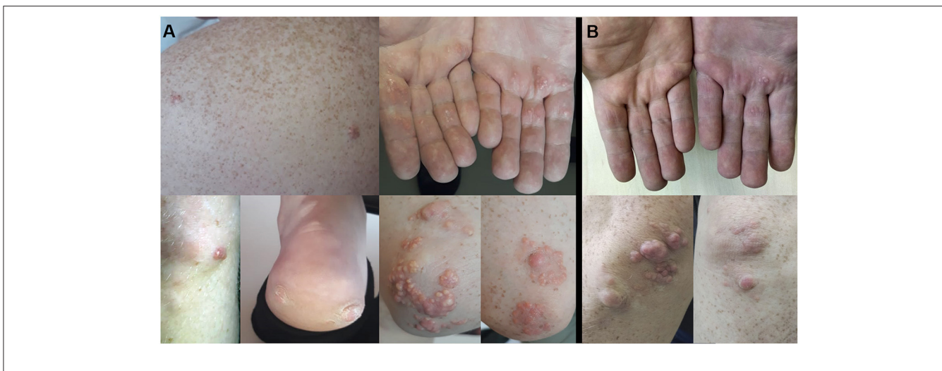
FIGURE 1 | Eruptive xantomas on back, palms, knee, heel, elbows, before (A) and after treatment (B).