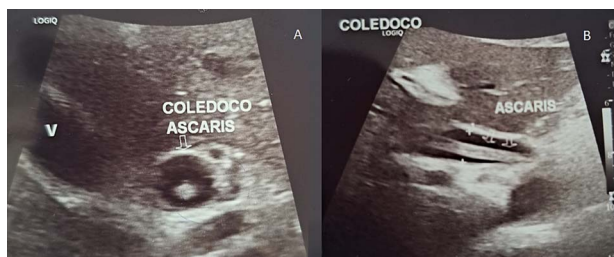
Figure 1. (A) Echography shows the bile duct dilated with the Ascaris inside it; (B) echography is a straight, non-shadowing echoic cord-like structure in the bile duct.