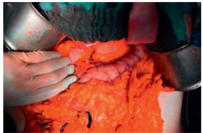
Fig. 2. Sleeve gastrectomy after atypical resection.

CT and MRI ruled out any presence of distant metastases. Clinical examination showed no evidence of further lesions. In the presence of a symptomatic solitary metastasis of the