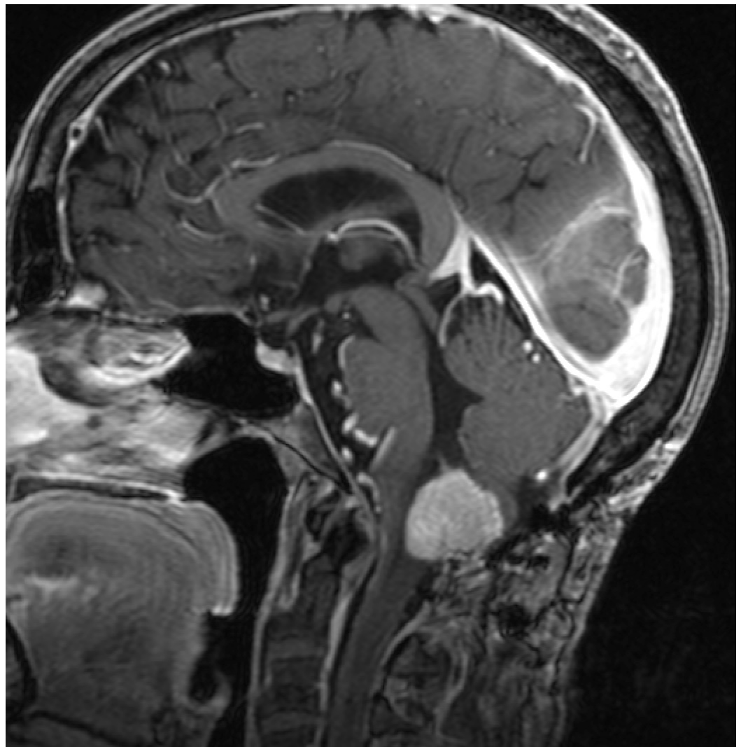
FIGURE 1: Recurrent Hemangioblastoma After Initial Resection

A 58-year-old female first presented to our service in 2002 with chief complaints of “constriction” on the right-hand side of her body, dysphagia, coordination difficulties, and nighttime hiccups. She subsequently underwent a magnetic resonance imaging (MRI) of the brain revealing a 2 x 2 cm midline posterior fossa cyst with an enhancing mural nodule. The patient underwent suboccipital craniotomy and resection of the tumor that proved to be a hemangioblastoma. While her follow-up imaging initially showed no recurrence, the patient began to experience a return of her symptoms six years after surgery and underwent an MRI showing tumor recurrence (Figure 1) at the cervicomedullary junction.