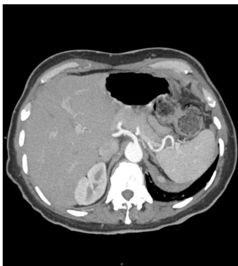
Fig. 1. Computed tomography – chest, abdomen, and pelvis from the first admission: No organomegaly, normal abdominal aorta, and diffuse degenerative spine changes.

Abdominal ultrasound from the current admission showed no gallstones, wall thickening, or pericholecystic fluid. Subsequent esophagogastroduodenoscopy performed by the gastroenterology team during the current