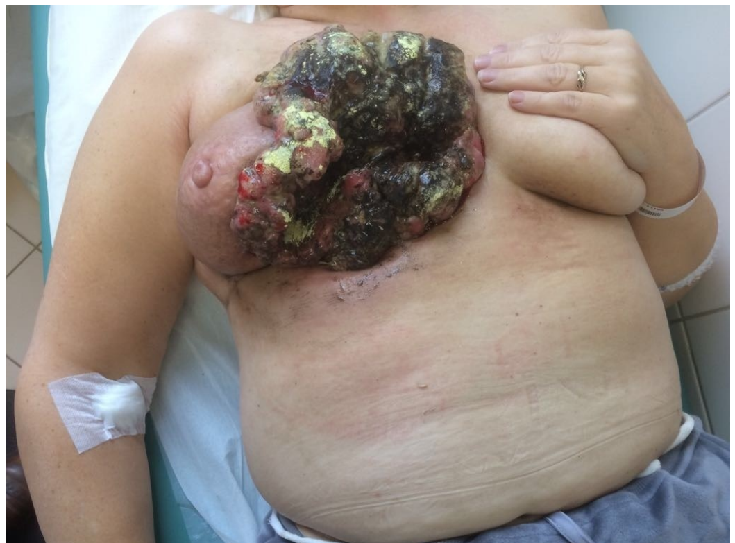
FIGURE 1: Picture of tumor before treatment

Six months later, in February 2017, she presented in the emergency room with symptoms of severe anaemia (blood haemoglobin 3,7 g/dL), Physical examination revealed bulky (7 X 15 cm), ulcerated, and actively bleeding carcinoma, eroding most of medial part of the right breast. The lesion was fixed to the chest wall and was producing an offensive smell (Figure 1).