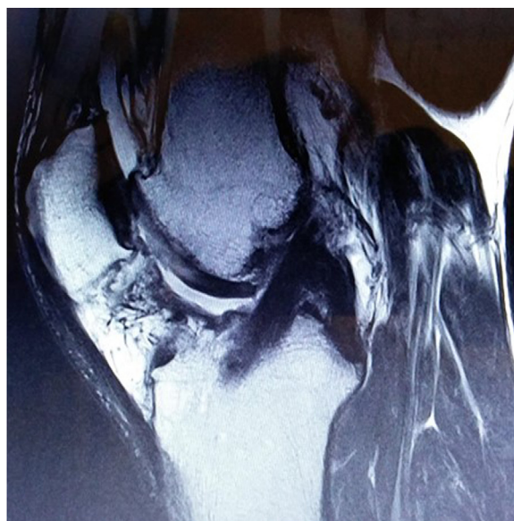
Fig. 2. Magnetic resonance imaging conducted 4 months after surgery, showing normal graft thickness and T2-hypointense homogeneous signal, regular borders, and full graft integration in the tunnels.

Post-surgery, the patient used crutches for 4 weeks, with tolerable body weight during this period. Full range of motion of the knee was allowed. During this 4-week period, slight muscle atrophy was detected. Physiotherapy rehabilitation was conducted once per day during 4 months. Magnetic resonance imaging was conducted 4 months after surgery, showing normal graft thickness and T2-hypointense homogeneous signal, regular borders, and full graft integration in the tunnels (Fig. 2). The patient started running at the 6 th month, and returned to full training without restrictions 8 months after surgery. Return to competitive match play occurred 9 months after surgery. The player is still competing at the elite professional level without any limitation, inflammation, pain or perception of instability over the last 36 months. Clinically, the