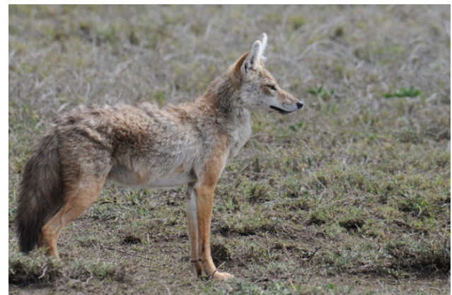
Fig. 1. —Adult Canis aureus in the Serengeti, Tanzania

Sacalius aureus : Hamilton Smith, 1839:214. Name combination.