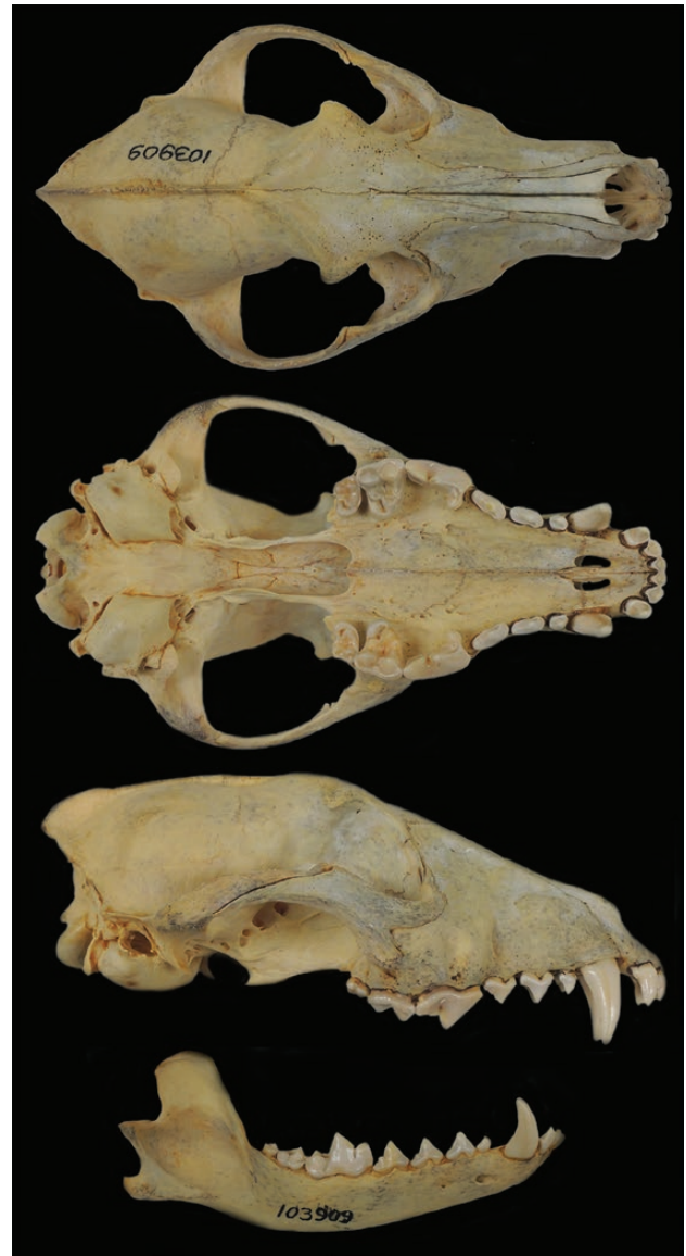
Fig. 2. —Dorsal, ventral, and lateral views of skull and lateral view of mandible of an adult male Canis aureus aureus (Field Museum of Natural History, Chicago, Illinois, [FMNH] #103909) from Maimana, Fariab, Afghanistan, 2,900 feet. Greatest length of skull is 177 mm.

Mean cranial measurements (mm, SD ; Fig. 2) on 10 mandibles and upper jaws of adult C. aureus in Iran were: length of skull, 169, 31.9; length of cranium, 101, 23.7; nasal length, 67, 16.6; cranial width, 72, 4.4; length of mandible, 112, 34.6; lateral alveolar root to mental foramen, 25, 1.7; mental foramen to caudal mandibular border, 87, 3.8; mandibular foramen to base of mandible, 12, 0.4; caudal border of mandible to below mandibular foramen, 11, 0.8; maximum mandibular height, 60, 5.8 (Mofared 2013). Mean measurements (mm, range) for 3 Lebanese adults were: greatest length of skull, 148.6 (135.2–157.4); condylobasal length, 142.9 (131.9–149.1); zygomatic breadth, 83.9 (73.3–90.2); breadth of braincase, 48.8 (46.0–50.3); interorbital constriction, 29.4 (25.5–32.7); maxillary tooththrow, 62.9 (60.4–65.0); mandibular tooththrow, 72.2 (58.2–74.9); mandibular length, 114.1 (104.1–121.0—Lewis et al. 1968). Mean cranial measurements (mm; with range and n ) of Egyptian adult C. a. lupaster were: condyloincisive length, 185.2 (173.5–196.0, 13); zygomatic width, 101.4 (93.5–111.3, 14); rostral width, 33.8