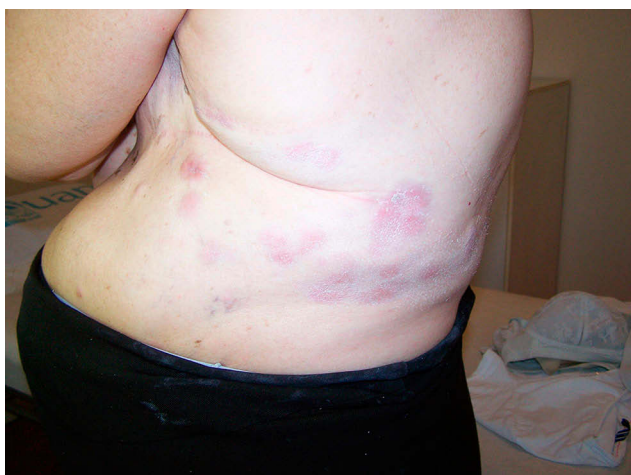
Figure 2 Left side of the body.

During palpation, one plaque was elevated with higher peripheral borders without central ulceration (Figure 3). Due to her medical history, there was no differential diagnosis issue, although the granuloma annulare was a possible alternative diagnosis. Histological examination of the skin biopsy, performed on the abdominal lesion, revealed an intact epidermis and a diffuse infiltration of the dermis by tumor cells. The immunohistochemical test was positive for cytokeratin 7 and ceb-2 , indicating a breast adenocarcinoma. Three phase bone scintigraphy and Computed Tomography scans (abdominal and retroperitoneal) showed no pathological findings. Blood test examinations were also normal. Carcinoembryonic antigen and antigen 15–3 were both normal.