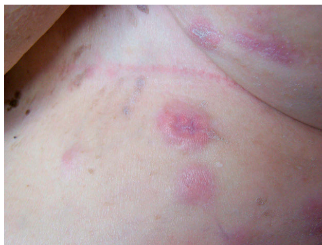
Figure 3 Plaques of the skin.