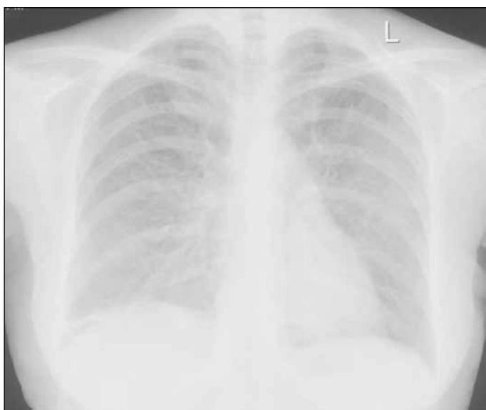
Figure 3: Chest X-ray showed complete resolution of diffuse interstitial changes after prednisolone therapy.