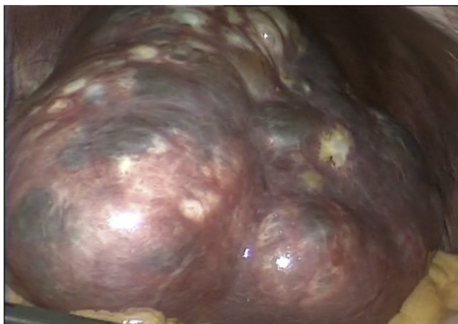
Fig. 2. Intraoperative image of splenic cyst during laparoscopy.

The operative time was 4 h and 30 min and blood loss was estimated at 300cc. The specimen was placed into a sterile laparoscopic bag and then morcellated within the bag, prior to removal through the umbilical port (Fig. 3). The patient was discharged on postoperative day 4. There were no postoperative complications and the