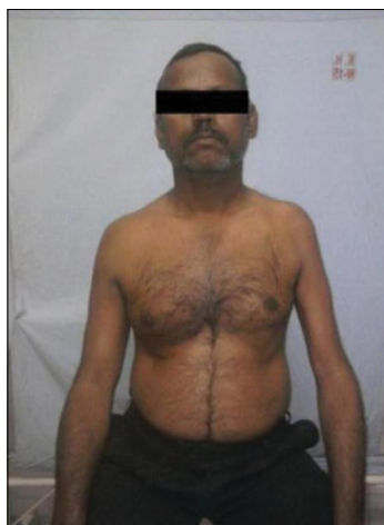
Figure 1: Involvement of muscles of left upper limb in Hirayama's disease

MRI cervical spine in Hirayama's disease may show the spinal cord compression on neck flexion with anterior shifting of posterior dura [Figure 2]. Nerve conduction studies frequently demonstrates the low amplitude compound muscle action potentials commensurate with degree of weakness, and atrophy. [5] The EMG findings usually show loss of motor unit potentials which are rapidly firing, high amplitude, and polyphasic, as seen in anterior horn cell disorders. [4,5,9] These changes are localized to lower cervical and T1 myotomes. Fibrillation potentials and sharp waves may be seen. [7]