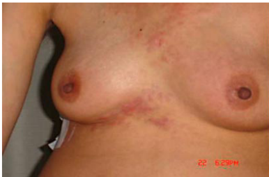
Fig. 1. Photograph showing bilateral breast lesions and skin nodules.

It is a well-known fact that signet-ring cell carcinoma of the stomach frequently presents as Krukenberg tumor. We present a case of gastric carcinoma that masqueraded initially as ovarian tumor and then, at recurrence, as primary neoplasm of the breast. Until its eventual uncovering, the covert gastric primary eluded the physicians on both occasions.