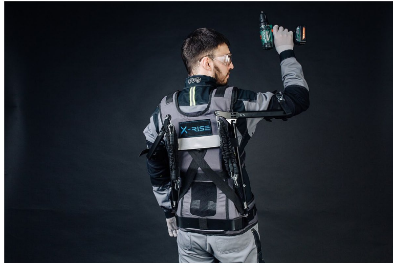
Figure 2. Upper body exoskeleton.

Note. Creative Commons Attribution-Share Alike 4.0 International license requiring author attribution.