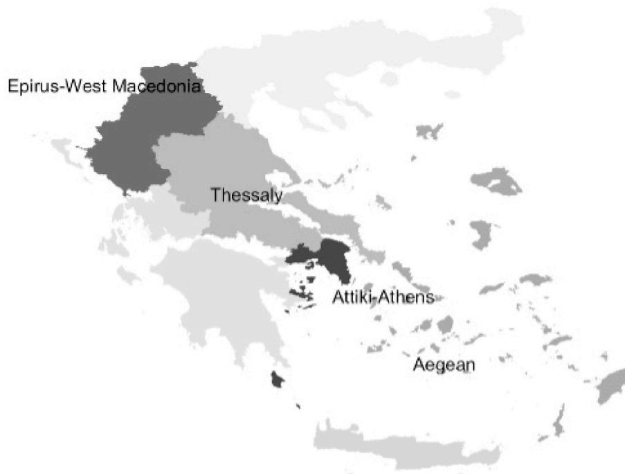
Fig. 1. Map of Regions in Greece. Treatment group: Attica (also known as Attiki). Control groups: Epirus-West Macedonia; Thessaly & Central Greece; Aegean.

percentage remained about the same, we argue that this can be used as an appropriate control group for our study.