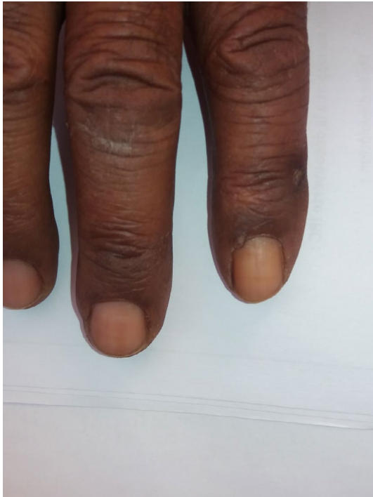
FIGURE 2 Absent lunula of the other fingernails