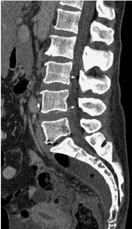
Fig. 3. CT scan of the abdomen showing multiple intraspinal fluid and air collections (white arrows) and a presacral abscess (black asterisk).