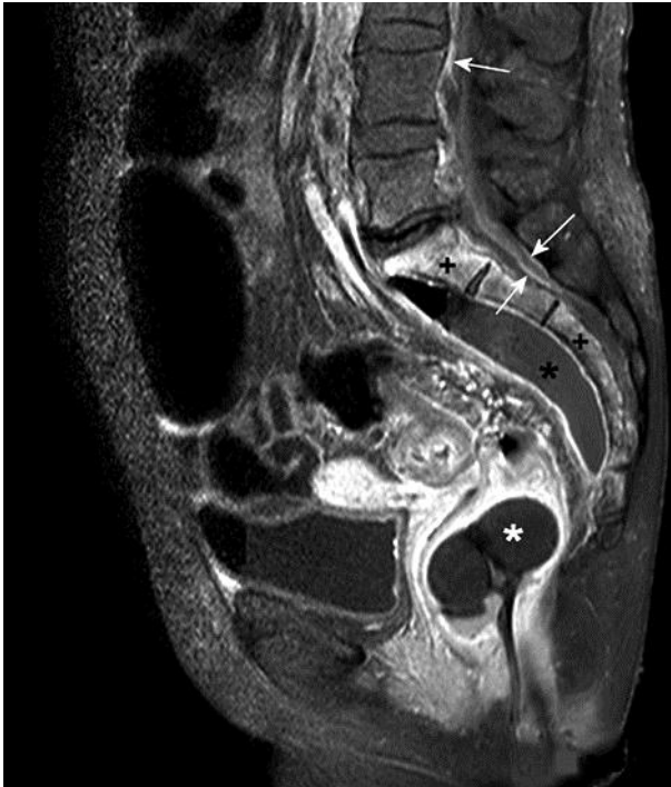
Fig. 2. T1-weighted MRI after gadolinium administration. Shown is the presacrally localized abscess (black asterisk) with complete staining of the border. There is diffuse staining of the sacral bone (plus symbols) without involvement of the intervertebral discs, which is suggestive of osteomyelitis. Furthermore, there is diffuse meningeal staining (white arrows) of the conus medullaris and cauda equina. A rectal device (white asterisk) is in situ.