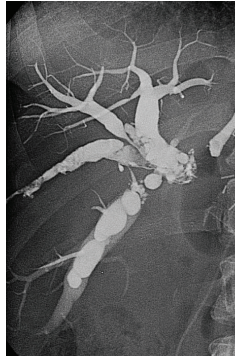
FIGURE 3: Intraoperative cholangiogram showing the complete filling with glue of excluded intrahepatic bile ducts.

A cholangiography through the T-tube was performed on postoperative day 14, and the T-tube was clamped before patient discharge. Three months after A/PSLT the T-tube was removed after a cholangiography with normal findings. One year after transplant the patient showed abnormal liver function tests, hyperbilirubinemia, leukocytosis, and elevated g-glutamyl transpeptidase (GGT), and mild elevation in alanine transaminase (ALT). The patient underwent a doppler ultrasound that showed (a patent hepatic artery) an intrahepatic bile duct dilatation and an anastomotic biliary