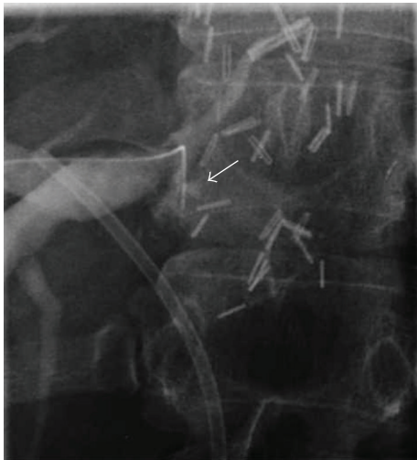
FIGURE 2: Cholangiogram showing the guide wire (arrow) during unsuccessful attempts to cross the anastomotic obstruction.

on the right graft. The common hepatic bile duct was left on the right graft. The patient was transplanted using the piggy-back technique without a veno-venous bypass. The biliary tract was reconstructed performing a duct-to-duct anastomosis using a T-tube by our standard technique previously described [5].