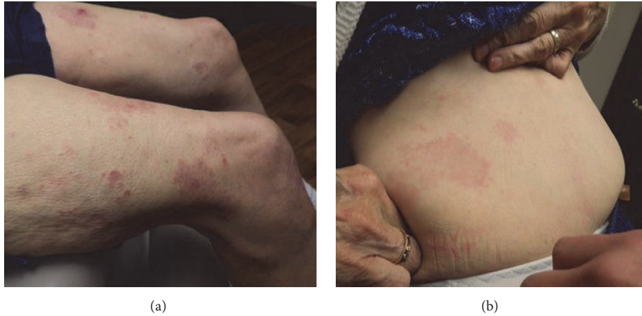
FIGURE 1: Patient's presentation with a new eruption in June 2017.